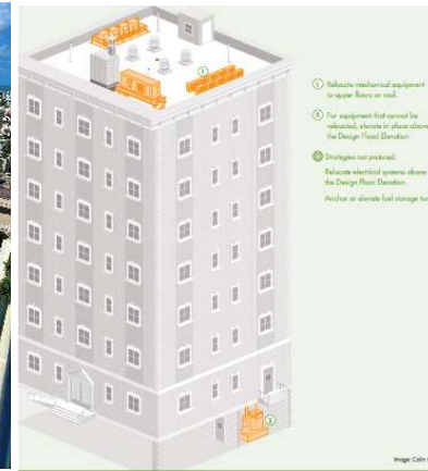
Relocated Mechanical Equipment