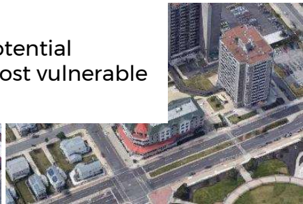
Whittington Senior Living